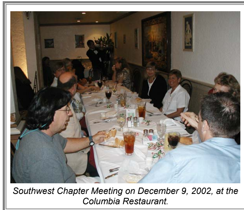
Southwest Chapter Meeting on December 9, 2002, at the Columbia Restaurant.