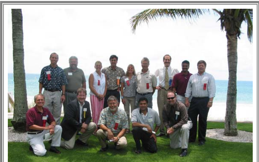
The 2001-2002 FLMS Officers and Board of Directors.

For more information on this years individual award recipients go the FLMS website . If you would like to nominate someone, contact any Board member.