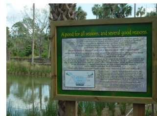
Central Florida Zoo LYL Project

For more details about the “Love Your Lake” cost-share program, please visit www.flms.net .