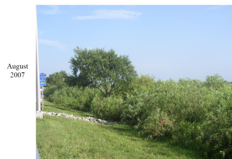
Before and After Pictures of Lake Jackson Shoreline

pool. The project's five funding entities included the Tourist Development Council: Lakes Fund, the Recreation and Parks Advisory Council, the City of Sebring, the Highlands Soil and Water Conservation District, and the Florida Lake Management Society: Love Your Lake Program. The Highlands County Natural Resources Department and the Highlands Soil and Water Conservation District would like to thank these partners for their contribution to the Lake Jackson Shoreline project.