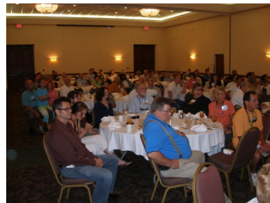
2008 FLMS conference attendees