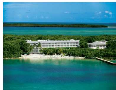
This year's conference location: Key Largo Grande

Come relax and enjoy the Florida Keys while networking with lake management colleagues and listening to the latest research!